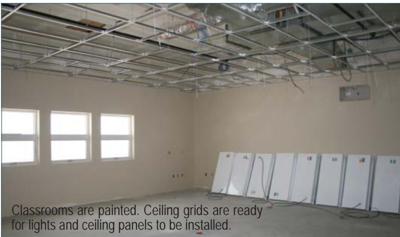
Classrooms are painted. Ceiling grids are ready for lights and ceiling panels to be installed.

I hope that you have been able to grow and reflect throughout this Lenten season. Know that my students and I are praying for you. Please continue to pray for all the little children that their eyes will always be open to the Light of Christ.