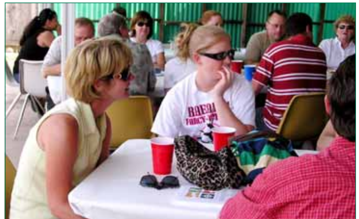
2005-06 RCIA folks gathered this month for a reunion picnic