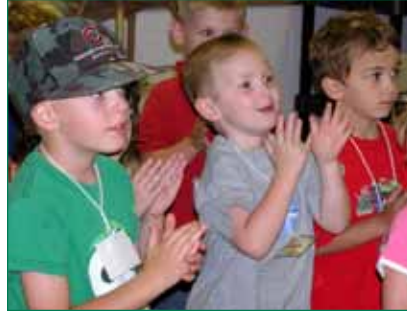
...clapping, dancing and singing...