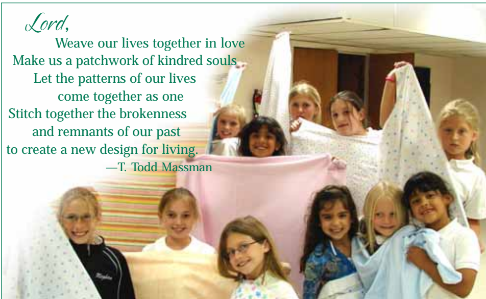
St Mary Girl Scout troop 130 made and donated baby blankets to Catholic Charities.