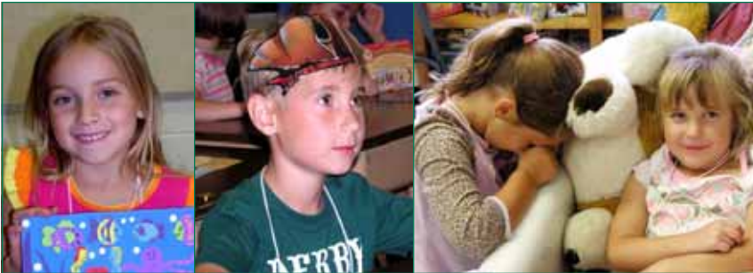
...making crafts...wearing pirate hats...acting out stories from the Bible

Thank you to all the adults and youth who helped with VBS!