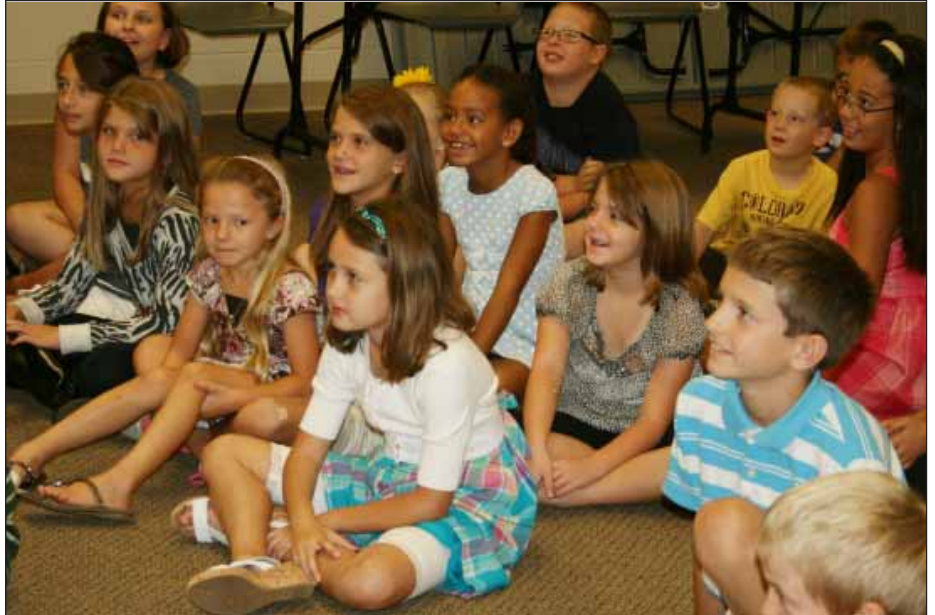
“Open my eyes, Lord. Help me to see your face. ... Open my heart, Lord. Help me to love like you.” Children soak up God’s Word at Children’s Liturgy.

Eucharist, our parish community and the life we share here at St Mary help give us eyes of faith, eyes to see the needs and the good in one another, and thankful hearts for all that God has given us. In sharing our gifts with our parish community, we help people grow in God’s abundant love. It is in giving that we receive.