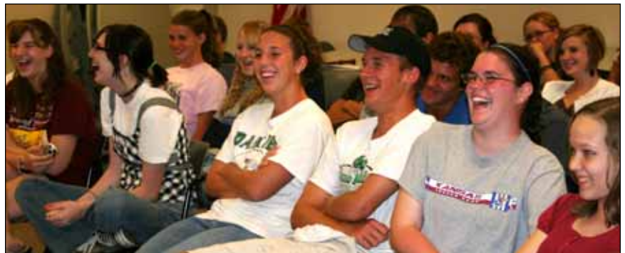
LIFE TEEN participants enjoy a zany skit during a recent Life Night.