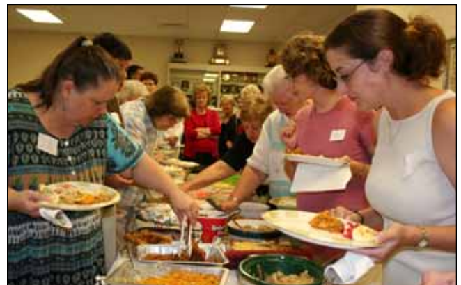
Fabulous food and friendships are two great reasons to participate in Altar Society!