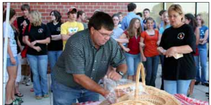
Faith formation , the decision to grow in relationship with God and with one another, is a choice. More on pages 4-6.

Sometimes we need professional help to overcome difficult issues. We may have grown up with heavy guilt or belief that we are "no good." We may have been raised in an unhealthy environment in which destructive behaviors were modeled for us as a way to survive. We can choose to continue in this life-taking behavior, or we can choose to take steps, though small, but still steps, to change.